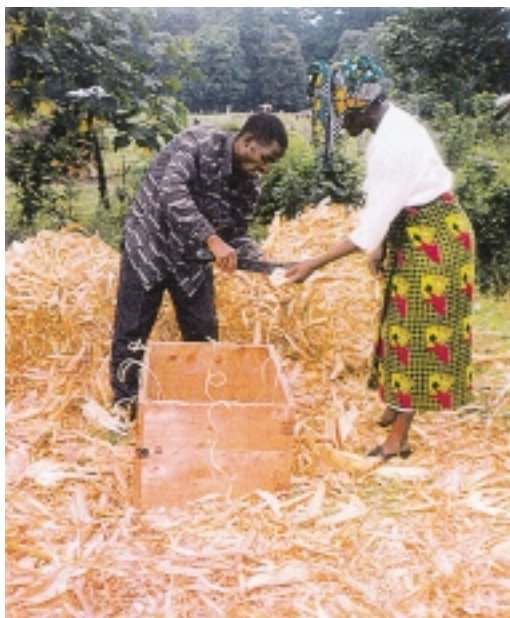
Manual box-baling of forage reduces transport costs. Farmers are cutting twine used to secure the bale (maize stover) which is compacted by trampling, then removed from the box.

Milk production is progressively more important on crop/livestock smallholdings in Tanzania as it increases cash income to women, improves child nutrition and produces manure for crops. However, profitable and sustainable milk production is constrained by the lack of farmer-evaluated strategies on how to make best use of indigenous forages and on how to apply new technologies, developed from on-station research, for better