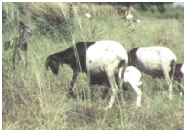
Poor people rely upon low quality roughages to feed livestock.

Analysis of conventional feeds in laboratories often cannot predict how much an animal will consume. It is therefore difficult to assess the probable level of animal production. Conventional feeding trials tend to be a time-consuming and expensive alternative. There is need for an animal-based method, suitable for use