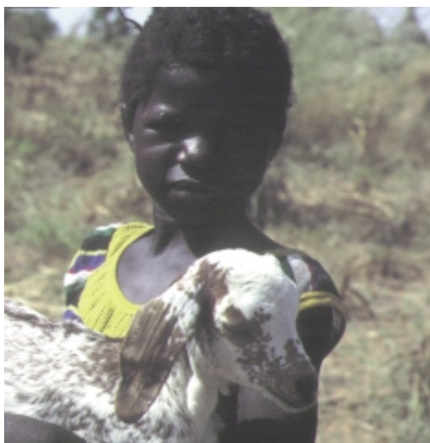
Small ruminants live closely with the people of West Africa, enhancing livelihoods and providing companionship.