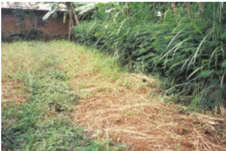
Farmers in Kenya already incorporate tree fodder into their forage cropping systems. This is a three-row intercrop of Desmodium (to the left), young regrowth of Napier grass and Calliandra in hedgerow form.

The potential contribution of tree fodder to livestock nutrition in developing countries has been widely appreciated and has been the subject of considerable effort in research funded both by DFID and other donors. A study on the effects of fodder from indigenous and exotic trees on the productivity of dairy cows, small ruminants and poultry should further underpin this research. Embu District, on the slopes of Mount Kenya, was identified as a suitable location as its topography would allow a range of impacts to be assessed. Despite the predominant interest in dairy cows, goats are also popular with farmers in this part of Kenya, because of their convenient size and