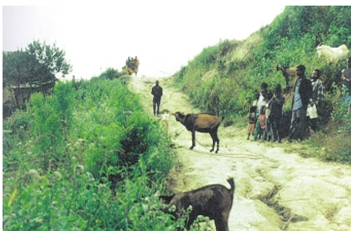
Sheep and goats are crucial to poor people's livelihoods but must be controlled to prevent crop damage in intensively cultivated areas.