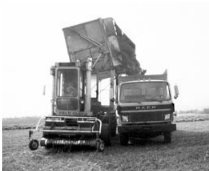
Production of silage has been relatively easy to mechanize.

Silage is produced by harvesting a forage crop at a high moisture content (greater than 50 percent) and subsequently fermenting that crop in pit,