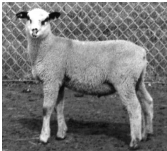
Figure 8. 2½-month-old crossbred ram lamb (Suffolk ram x Florida Native ewe)