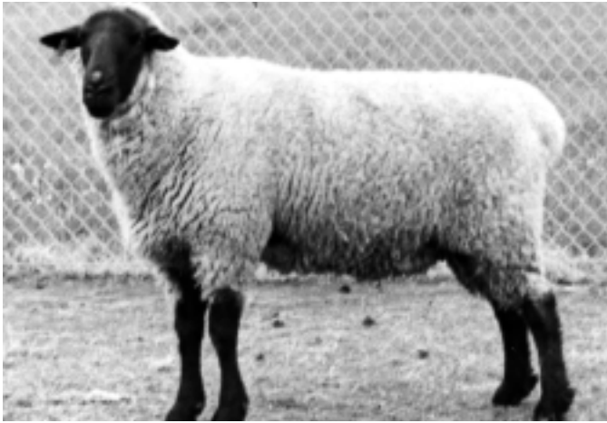
Figure 3. Mature purebred Suffolk ram