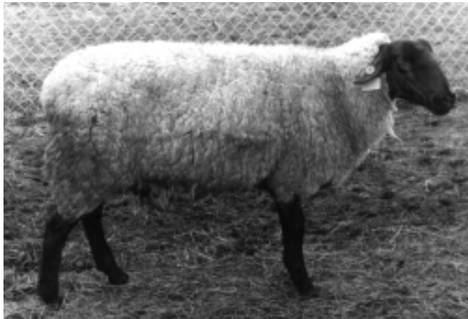
Figure 5. Mature purebred Suffolk ewe