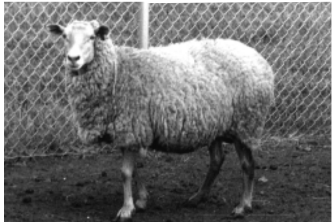
Figure 6. Mature purebred Florida Native ewe

There is a substantial body of evidence that supports variation among breeds in resistance to internal parasites, particularly to Haemonchus contortus , Ostertagia circumcincta , and Trichostrongylus spp. For example, the Florida Native is much more resistant to Haemonchus contortus than are the European breeds Rambouillet and Merino as well as the Suffolk breed. In a more recent trial conducted at Alabama A&M University, Ruvuna and Stephens (1997) observed that the egg per gram (EPG) of feces was approximately eight times lower in Florida Native ewes than in Suffolk ewes under natural conditions of infection (Figures 3 through 6). The resistance values of Florida Native and Suffolk in this trial