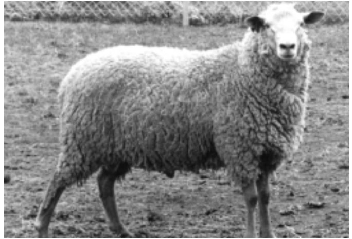
Figure 4. Mature purebred Florida Native ram