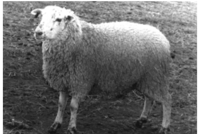
Figure 7. Yearling purebred Florida Native ram

Fecal egg count (FEC) and packed cell volume (PCV) of blood are measurements that can be used as a way to monitor parasite infection in lambs and in ewes just before lambing and during lactation. FEC is both a repeatable and heritable trait and does respond to selection (Baker et al, 1992). Ideally, each time FEC or PCV is measured, a larval culture should be taken to provide an approximate indication of which parasite species are present. Sheep producers may negotiate with a local veterinary practice for the lab work to be done. Most small animal veterinary practices have the necessary equipment and conduct these tests on pets.